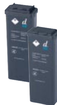
SHARPSBIN™ pocket-black (DD441/441L) 0.5L