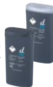
SHARPSBIN™ worx (DD443/443CL) 0.25L