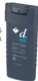
SHARPSBIN™ 0.6 (DD509B) 0.6L