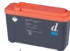
SHARPSBIN™ comm-plus (DD479B) 1L

We also stock a range of larger containers (up to 60L capacity) to aid with the collection of the NX Compact Range. Please ask for further details.